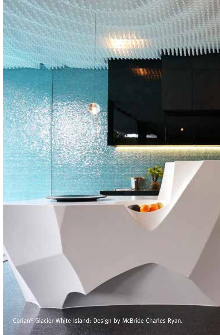
Corian® Glacier White Island; Design by McBride Charles Ryan.

As the suppliers of Corian® Products, CASF Australia is committed to providing you with the highest levels of customer service. Should you have any questions about caring for your Corian® surface, please contact our Contact Service Centre on 1800 267 426 or corianinfo@casf.com.au